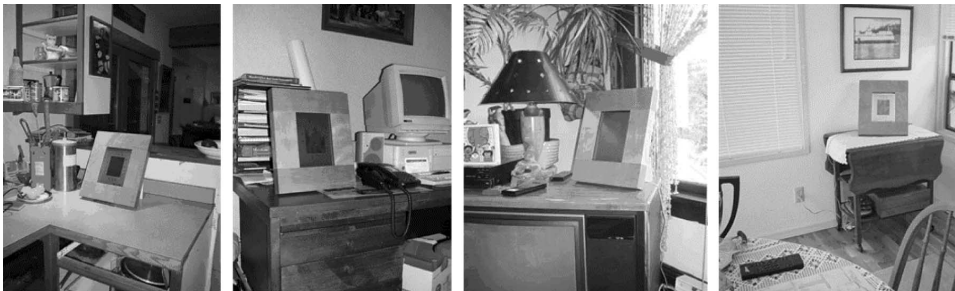
FIGURE 2 The CareNet Display prototype as deployed in the homes of participants during the in situ Woz evaluation. Participants kept the display in various “public” places within their homes including (from left to right) the kitchen, home office, TV room, and dining room.

To accurately assess the use and value of this technology for an elder and his or her support network, it was critical to situate it within the environment of its intended users. Thus, to gather early feedback about the CareNet Display concept and design, we deployed a “working” prototype in the homes of two to three family members per elder (four elders total) for 3 weeks each ( N = 13 ). The prototype consisted of a touch-screen tablet PC housed in a custom-built wooden picture frame (Figure 2) and, to the participating family members, appeared to be fully functional. However, the sensors that we envisioned using to collect data about the elder’s activities and events were not ready to be used in a multiweek deployment in an elder’s home. Therefore, we simulated the sensor data collection by phoning the elder and/or primary caregiver several times per day each day of the 3-week deployments. We then updated the displays manually via a secure Web connection. We used General Packet Radio Service to provide always-on wireless Internet