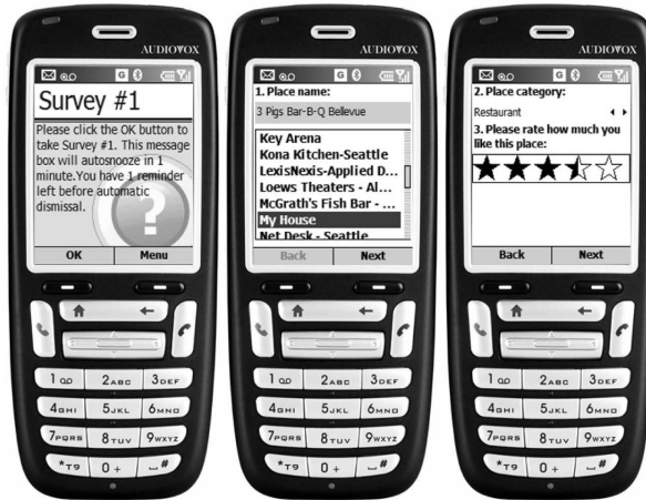
FIGURE 3 ESM questions on the SmartPhone Audiovox SMT 5600. Shown are examples of the survey prompt screen (left), text entry auto-completion (middle), and rating scale (right) questions used in the “voting with your feet” study.

short, qualitative accounts. The Web diary data were partially structured by automatically displaying the time-stamped location activity data supplied from the field, which was sent/synchronized to our Web server once an hour. When participants logged in, they would see a chronologically ordered journal view of their place visit activity. The diary system would then ask them some specific qualitative questions about one or two randomly selected public place visits. In particular, we asked the reasons for their visit, feedback about their rating, and if they would recommend the place to others. Despite the obvious additional burden that this technique placed on our participants, 5.8 Web diary sessions per week were completed per participant. This exceeded our expectations, as the study consent form requested only four sessions per week.